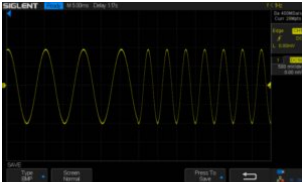
Figure 2: Transition from 100 Hz to 200 Hz using Independent Mode.