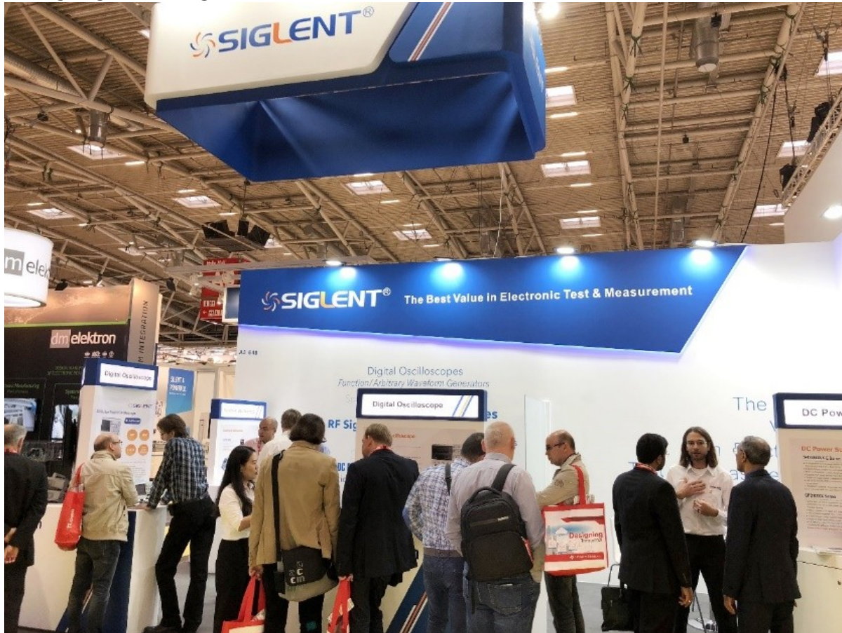
Picture1.the exhibition scene

Munich, Germany—The world's leading trade fair and conference for electronics was held in Munich during the week of the 13th of November, 2018. The Electronica fair is an exhibit that focuses on international high-tech companies, including an exclusive pavilion dedicated to electronic test & measurement instrumentation. SIGLENT attended the exhibition, showing their most advanced products as well as some cutting-edge technologies to the elites who came from more than 50 countries.