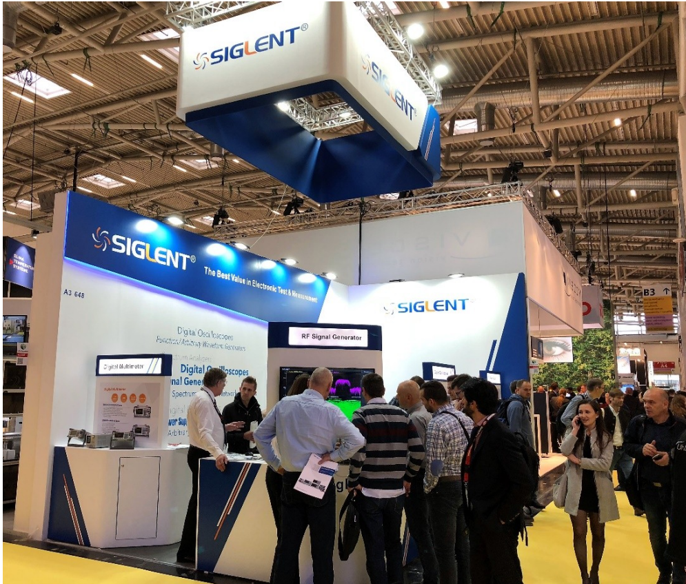
Picture3. Many visitors focus on SSG3000X

Another excellent RF product shown was the SIGLENT SVA1000X, which is the first analyzer in China that combines the function of spectrum and vector network analysis together. It attracted loads of visitor's attention due to its innovative features and reasonable price.