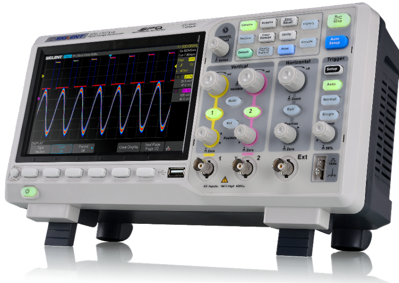
Picture2.SDS1202X-E super phosphor oscilloscope

In the RF field, SIGLENT showcased the new SSG3000X. It is a RF signal source whose high-purity phase noise is -110 dBc/Hz. This type of signal source supports multiple modulation methods and a web-browser based remote control interface making it an ideal choice for electronic testing in many fields such as EMC susceptibility/immunity, wireless communications, IoT (the Internet of Things), and automotive electronics.