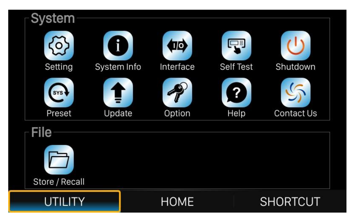
Figure 1 UTILITY function menu

4. Press Update and then enter the file system (or you can press Store/Recall button to enter the file system).