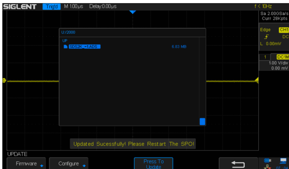
Figure 3 Update successfully

Note: during the updating, do not turn off the power or pull out the U-disk.